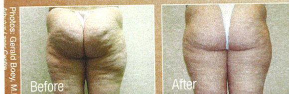
Post four treatments.