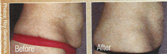
Post three treatments.