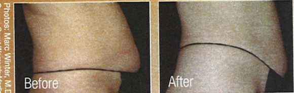
Post five treatments.

*FDA cleared for temporary reduction of thighs circumferences and temporary reduction in the appearance of cellulite. © 2008. All rights reserved. Syneron, the Syneron logo, VelaShape, the VelaShape logo and elōs are trademarks of Syneron Medical Ltd. and may be registered in certain jurisdictions. elōs (electro-optical synergy) is a proprietary technology of Syneron Medical. 00403 V2