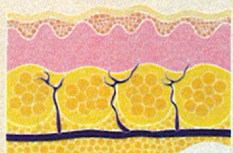
Skin before VelaShape treatments.

Result in an average circumferential reduction of 0.5 - 3 inches.