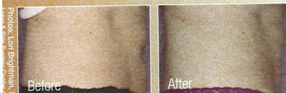
Post three treatments.